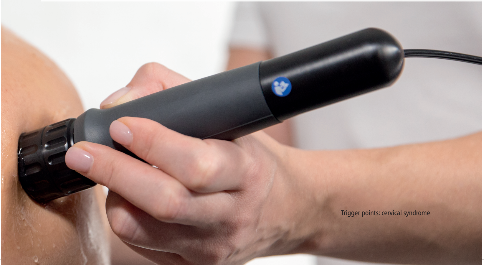
Trigger points: cervical syndrome