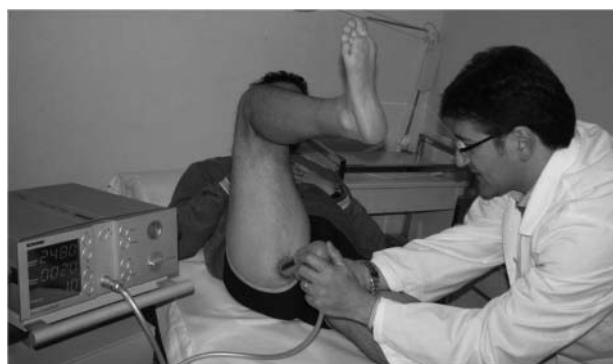
Figure 2. Application of shockwave treatment.

a Values are the mean ± standard deviation. SWT, shockwave therapy; TCT, traditional conservative treatment; CI, confidence interval; NPRS, Nirschl phase rating scale; VAS, visual analog scale.